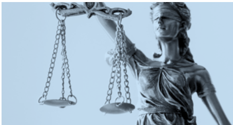
Criminal Appeals & Post-Conviction Advocacy with the Office of the Appellate Defender