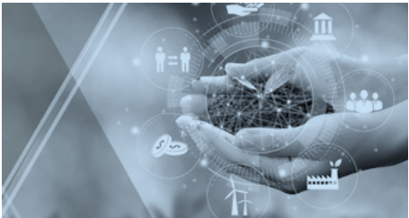
The Global Energy Challenge