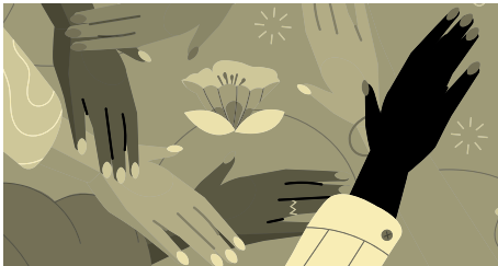
INCREDIBLE: Women, Credibility & the Justice System with the D.C. Volunteer Lawyers Project