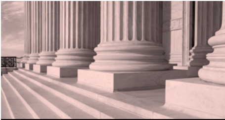
Gun Safety Advocacy & Policy with Everytown for Gun Safety and the Giffords Law Center to Prevent Gun Violence