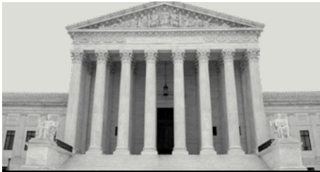
The Current State of Juvenile Life Without Parole