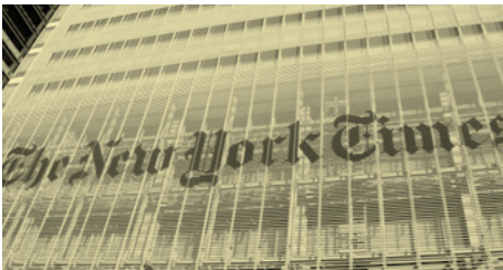
The NYT Afghan Asylum Project

We regularly bring the firm together to explore current issues and developments in the pro bono space, while also celebrating the many ways our attorneys and our Cleary Fellows engage in critical work on behalf of their pro bono clients to address the most significant legal issues of our time. This year’s special events included: