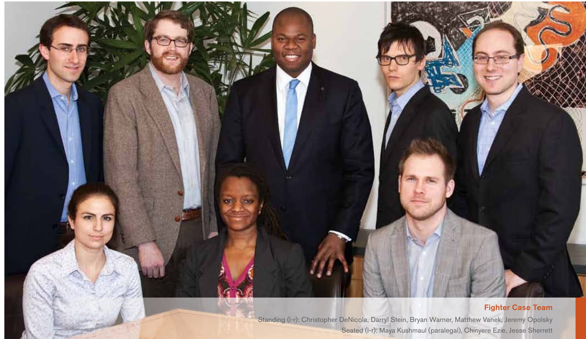
Fighter Case Team

Throughout 2011 and 2012, Cleary Gottlieb worked with The Bronx Defenders to address the denial of meaningful access to justice in the Bronx criminal courts for the thousands of people arrested for low-level marijuana possession every year. Cleary Gottlieb and The Bronx Defenders interviewed and represented over 500 clients who were arrested and charged with marijuana possession in the Bronx. 54 “fighter” clients ultimately chose to contest their charges as a way of highlighting the unconstitutional “stop and frisks” leading to their arrests. In April 2013, The Bronx Defenders released a report, No Day In Court , concluding that it was almost impossible for any fighter to get his day in Court in the Bronx. Instead, prosecutorial delay, manipulation of the Speedy Trial Act, pressure to plead guilty, and the requirement that the clients be physically present in court for each court date, systematically deprived each fighter of his day in court. We are proud that more than 50 Cleary Gottlieb lawyers and paralegals worked with The Bronx Defenders on this important project.