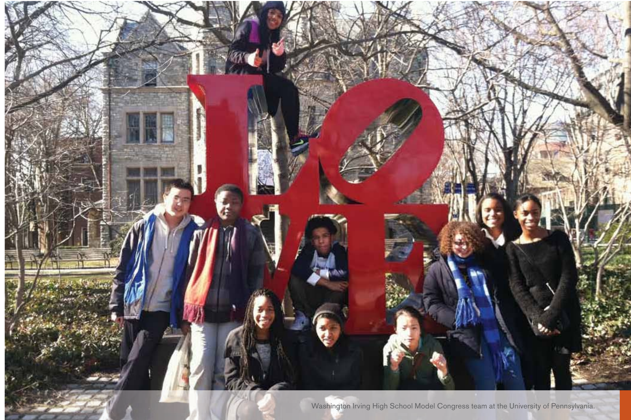
Washington Irving High School Model Congress team at the University of Pennsylvania.