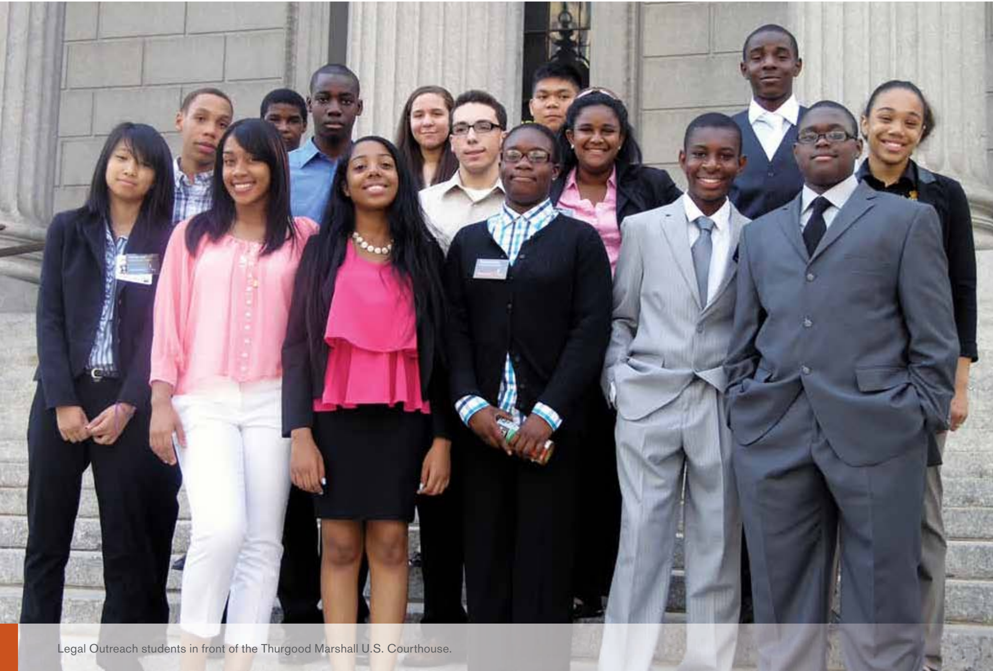
Legal Outreach students in front of the Thurgood Marshall U.S. Courthouse.